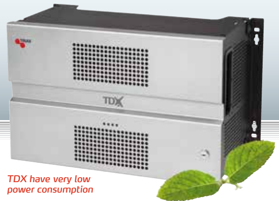
TDX have very low power consumption

The multicast management protocol ensures TV streams not requested on a particular network segment are not forwarded, maximising the efficiency of the network.