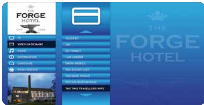
Example of TRIAX Middleware GUI on TV

The GUI gives end-users access to a wide range of content from a full television and radio service to movies, guest information, local weather reports, App's, and much more.