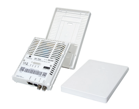
End-Point with WiFi and Ethernet over Coax, AC, Pro