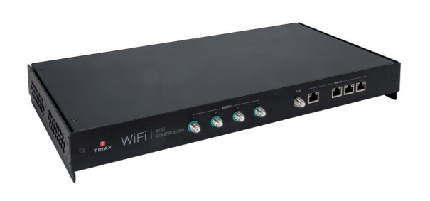
Controller for 32/64 Ethernet over Coax End-Points and WiFi, Pro